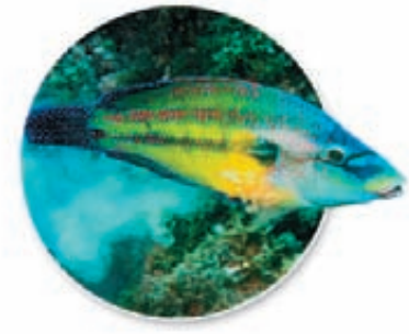
FIGURE 28-17 External Fertilization One type of external fertilization results from spawning. When aquatic animals spawn, females release eggs and males release sperm at the same time. Infer What is the cloudy substance behind this spawning male wrasse?

Study Wkbks A/B, Appendix S20, Compare/ Contrast Table. Transparencies, GO3.